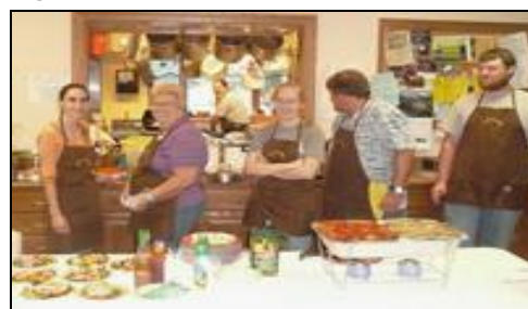
Holy Smokes! Fellowship Café Cheswick, PA