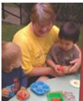
A Second Cup Pittsburgh, PA