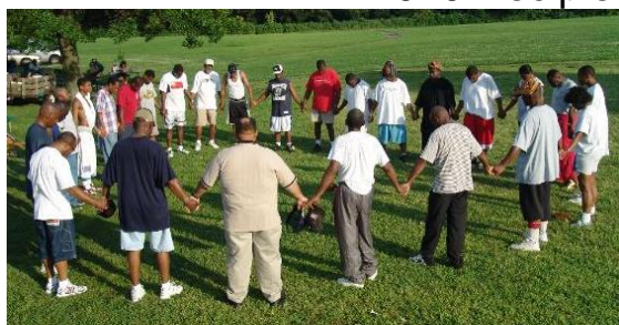
The Alumni Group Wallingford, PA